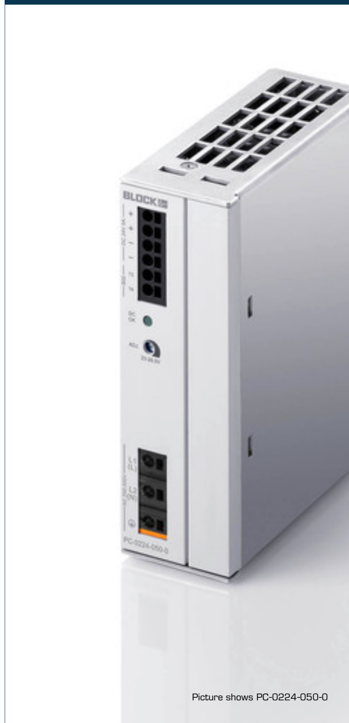
Picture shows PC-0224-050-0