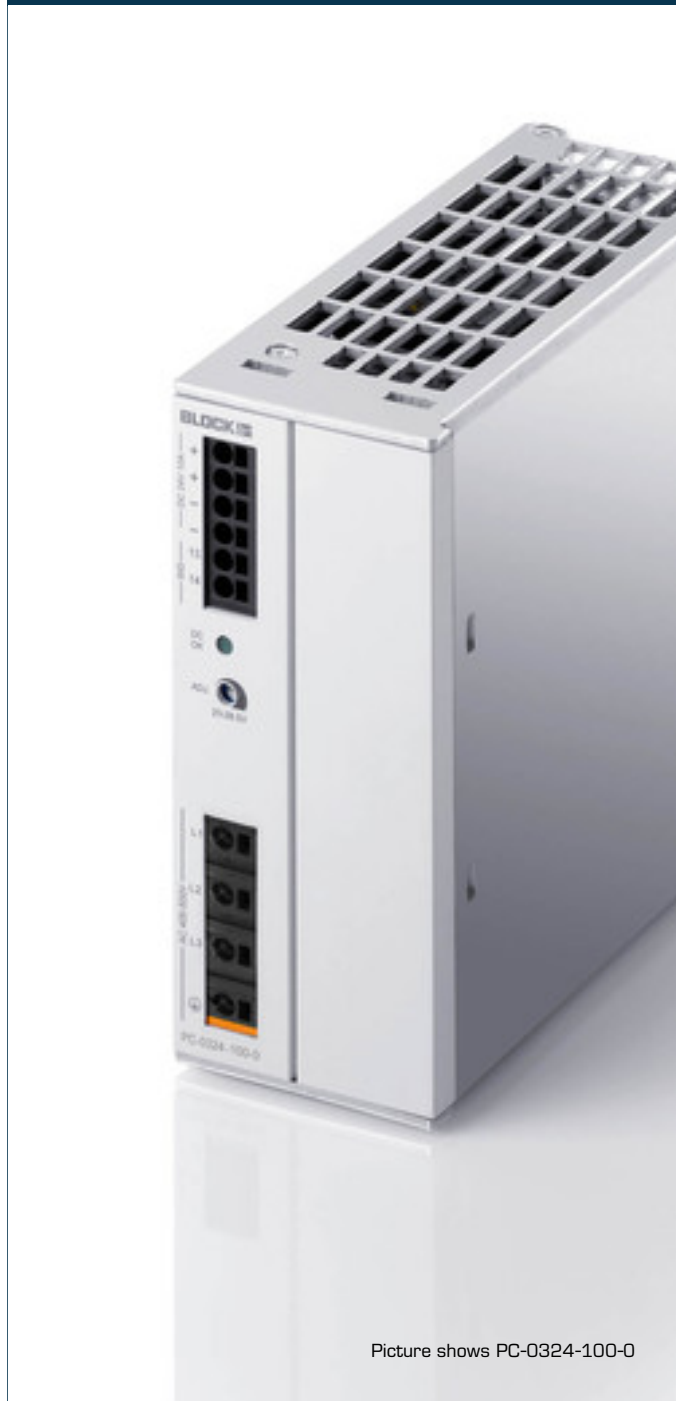
Picture shows PC-0324-100-0