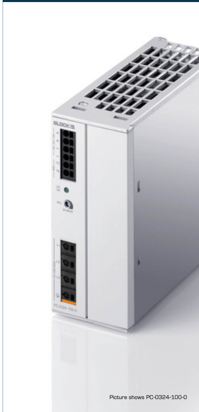
Picture shows PC-0324-100-0