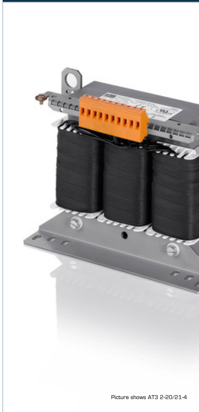
Picture shows AT3 2-20/21-4