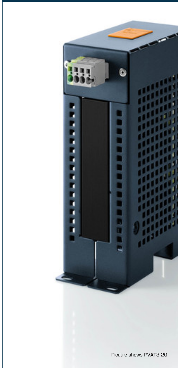
Picture shows PVAT3 20