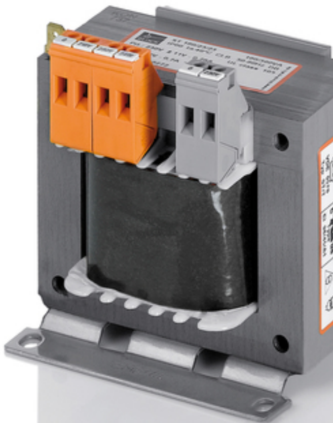
Picture shows ST 160/23-23