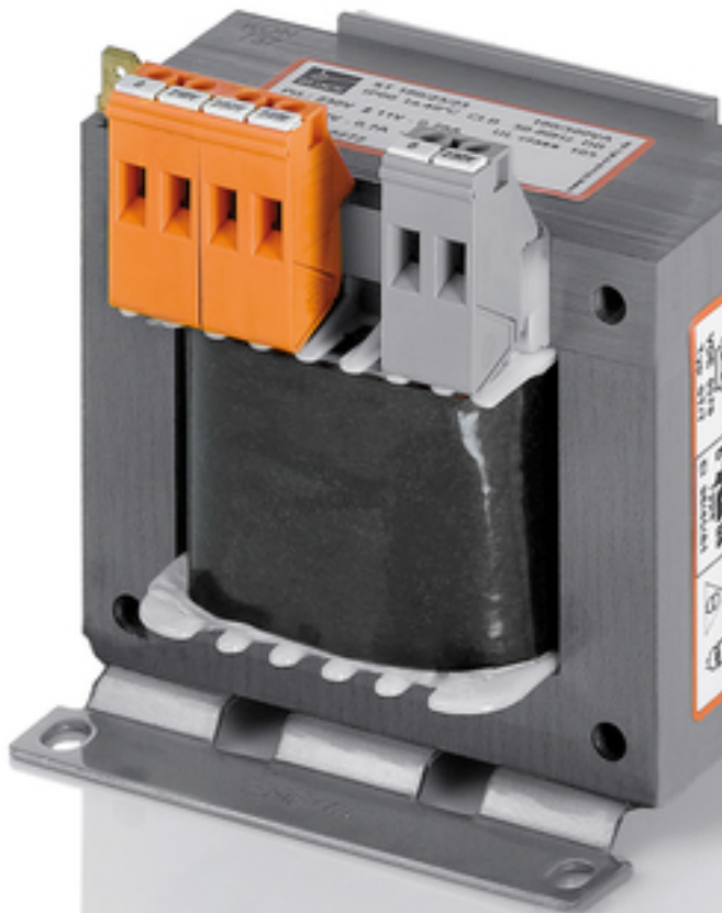
Picture shows ST 160/23-23