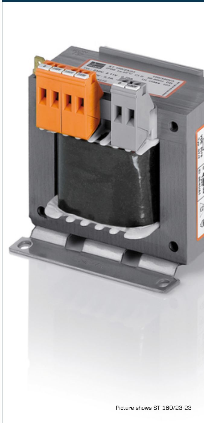
Picture shows ST 160/23-23