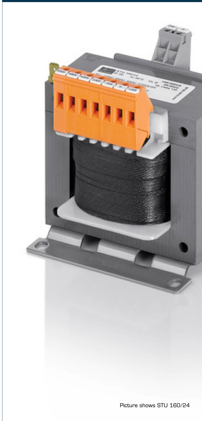
Picture shows STU 160/24