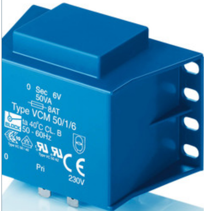
Picture shows VCM 50/1/6