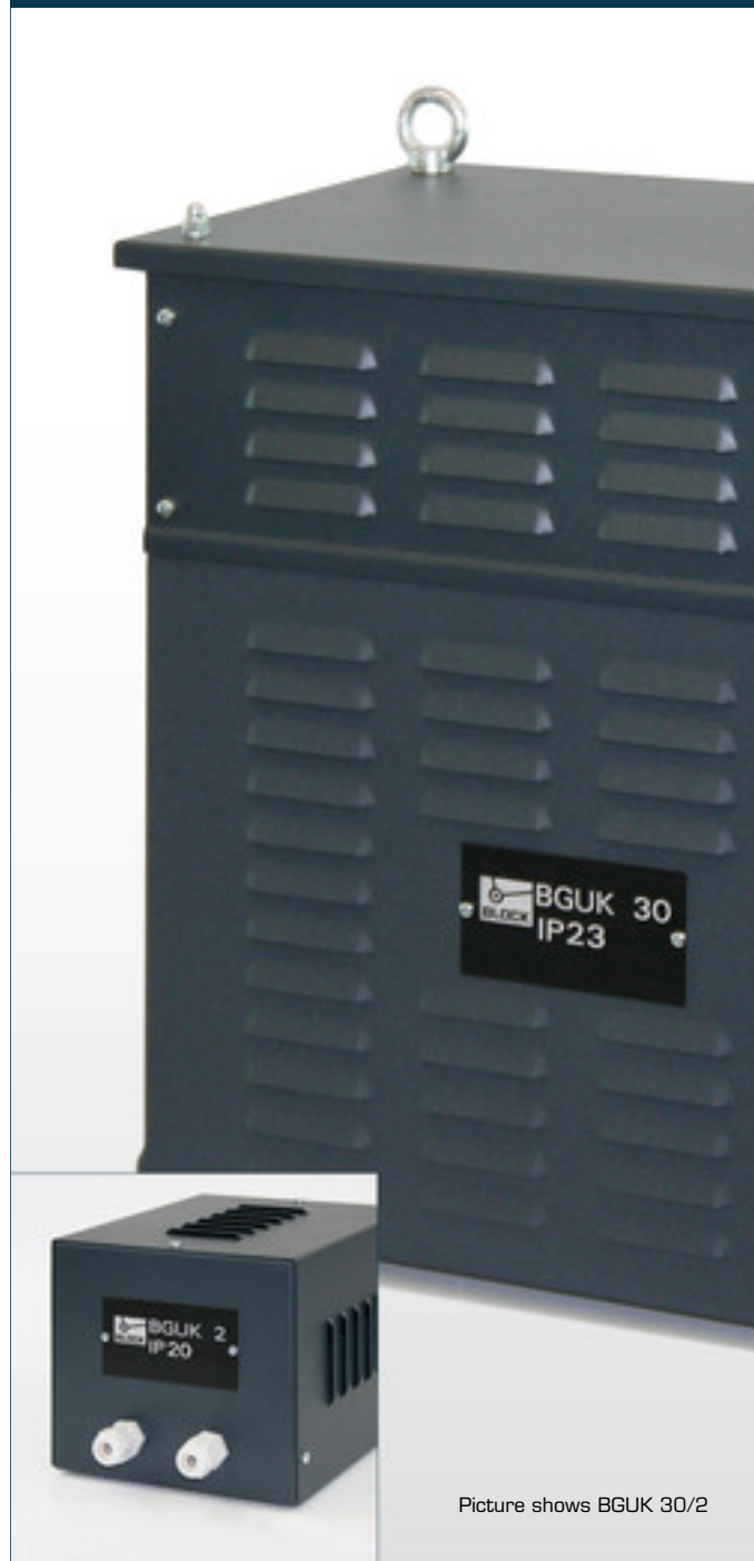
Picture shows BGUK 30/2