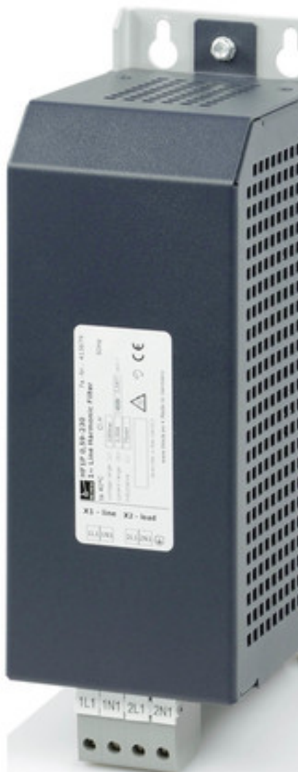
Picture shows HF1P 0,59-230