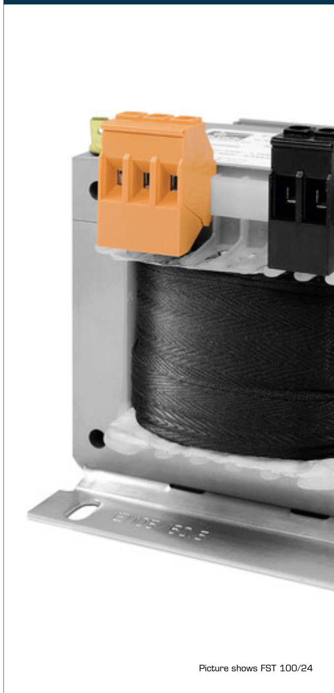
Picture shows FST 100/24